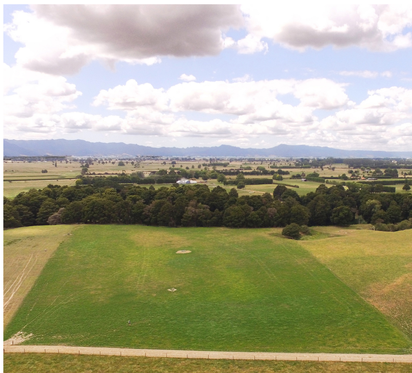
Maxsyn paddock, standing out in North Waikato in January.

Warm season growth is Maxsyn 's super-power. If you've ever run short of feed in summer, you know how valuable this is. Visually you can see the difference - Maxsyn stays green longer when the heat is on. Maxsyn NEA12 takes this up a notch, with over 4% more summer yield than NEA4 .