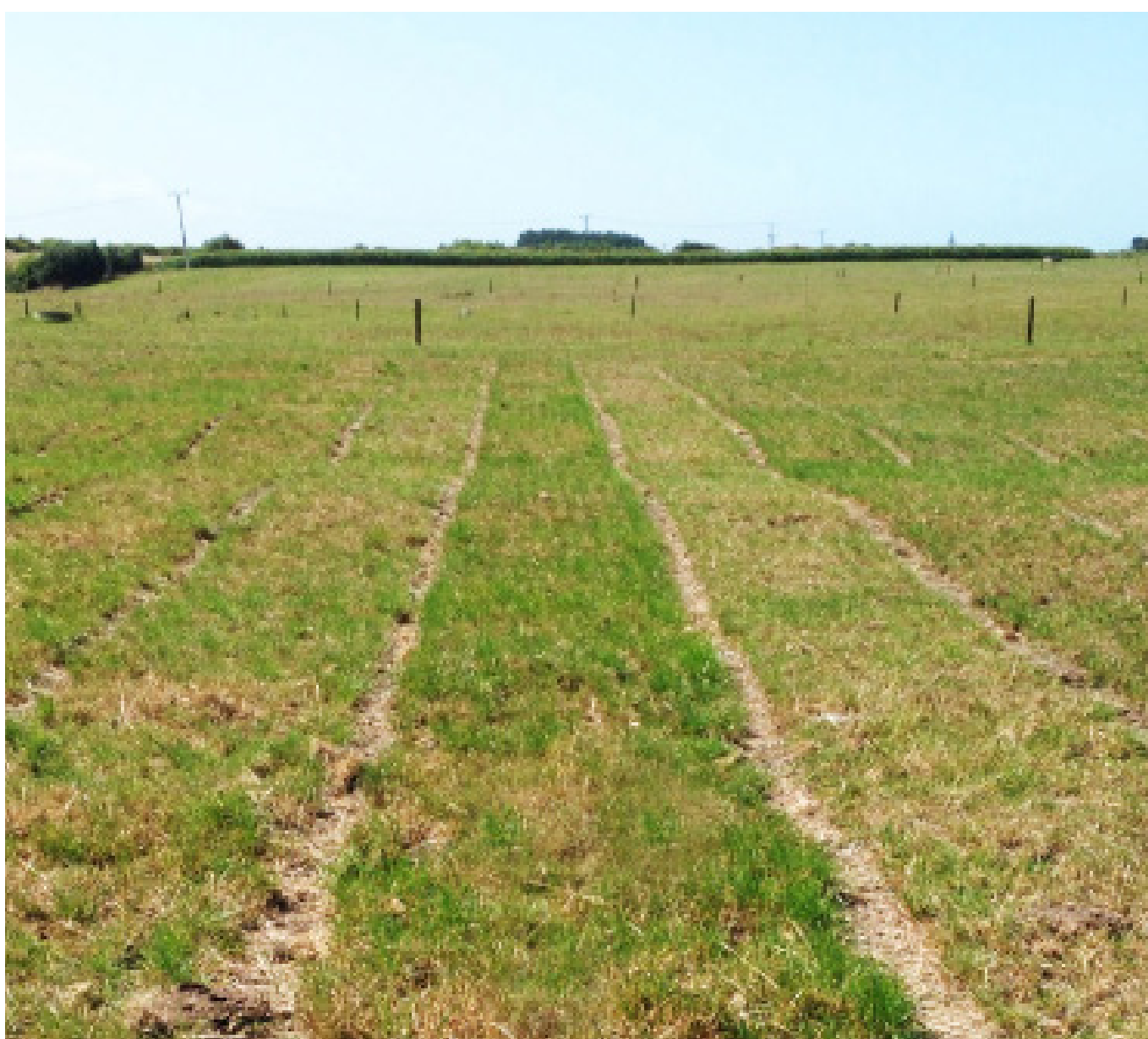
Maxsyn , centre, still green in Taranaki in February.