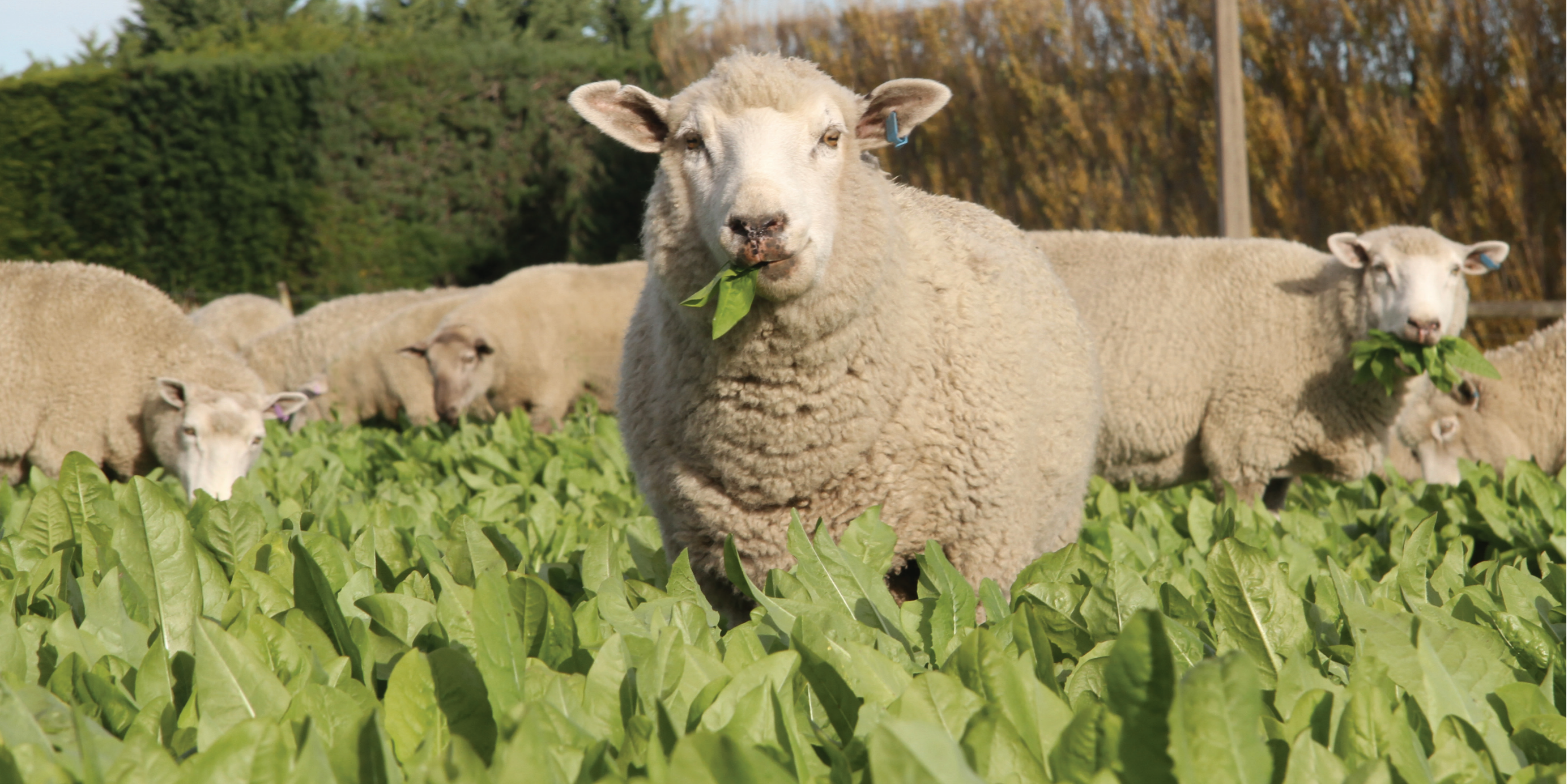
501 Chicory is owned and marketed by Barenbrug