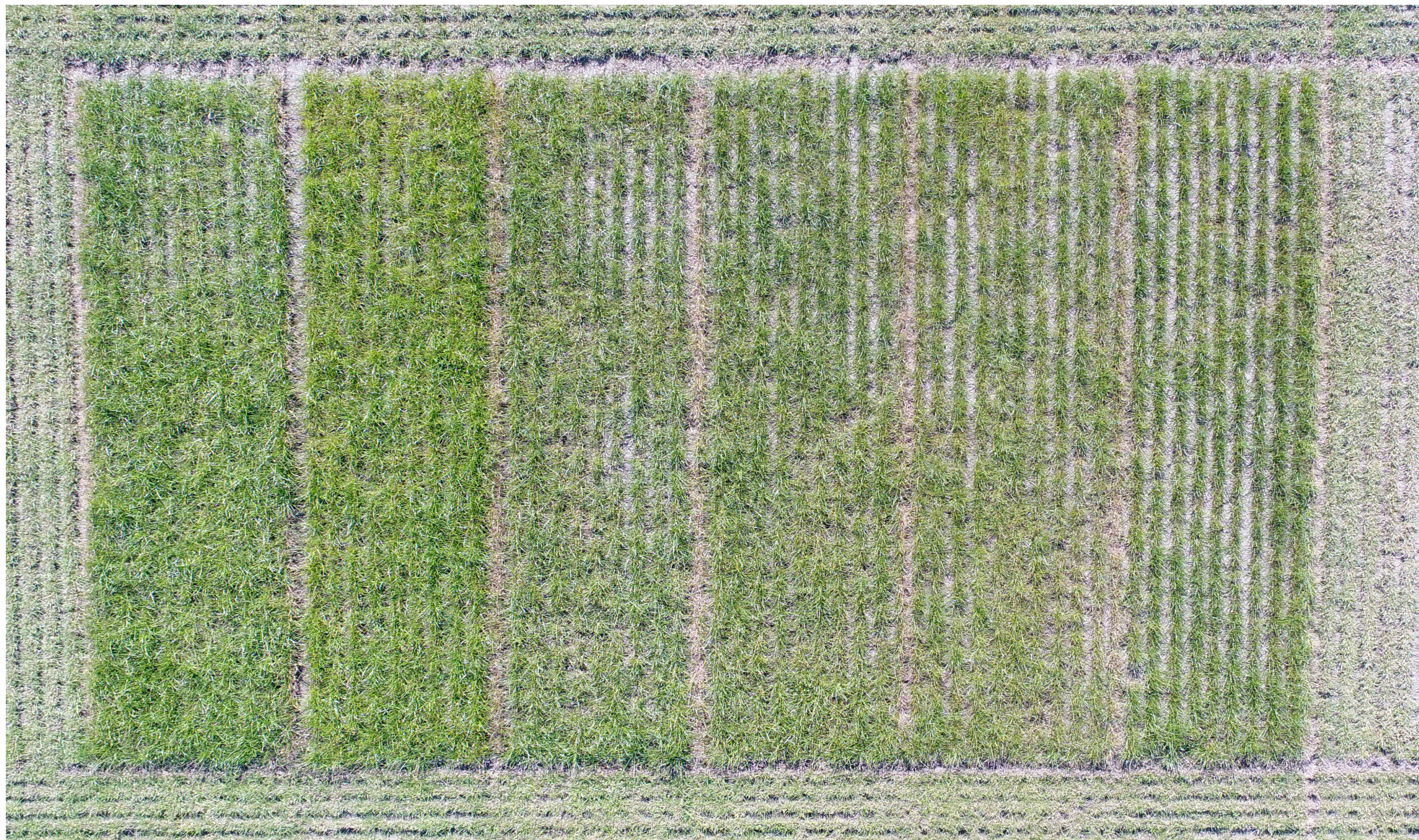
Drone photo of six leading cultivars in a low nitrogen trial. Array (second from left) was greener, grew more, demonstrating its ability to extract more nitrogen from the soil.

In trials, Array has grown significantly more feed under low nitrogen conditions than other ryegrass cultivars.