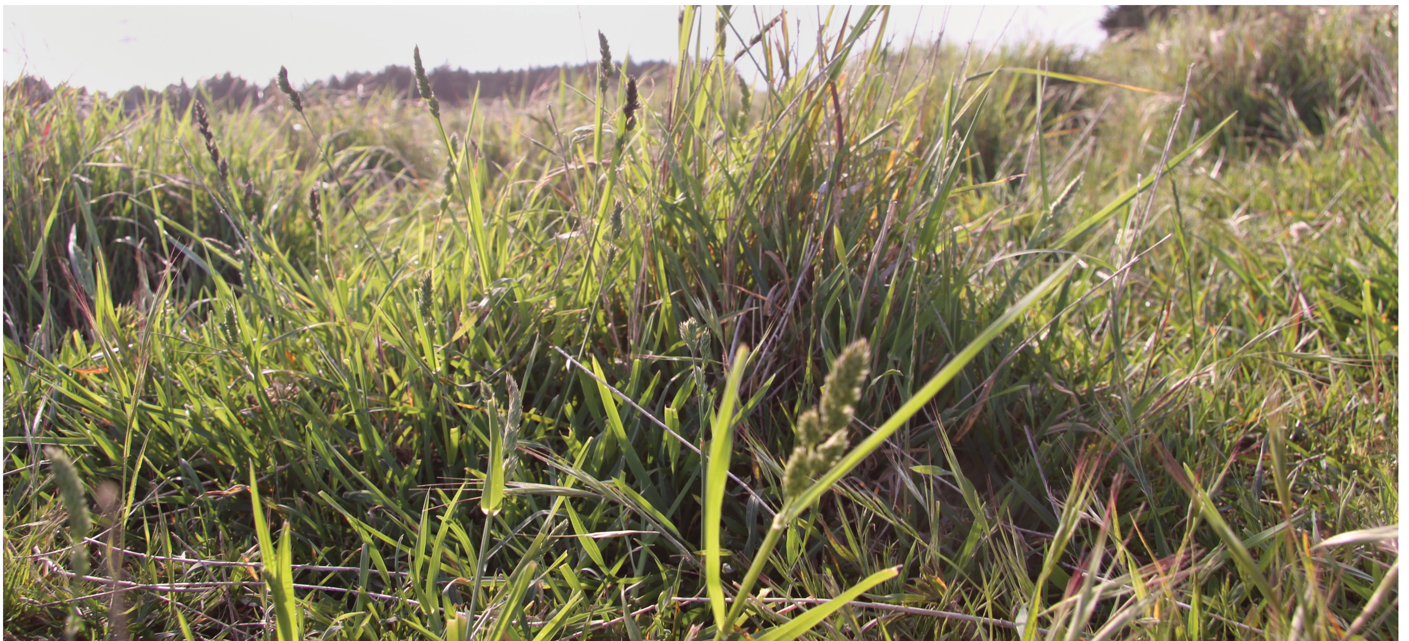
Old cocksfoot can become low in crude protein and less palatable.

This is key, because when cocksfoot is low in crude protein (look for yellow leaves), palatability and animal performance is poor.