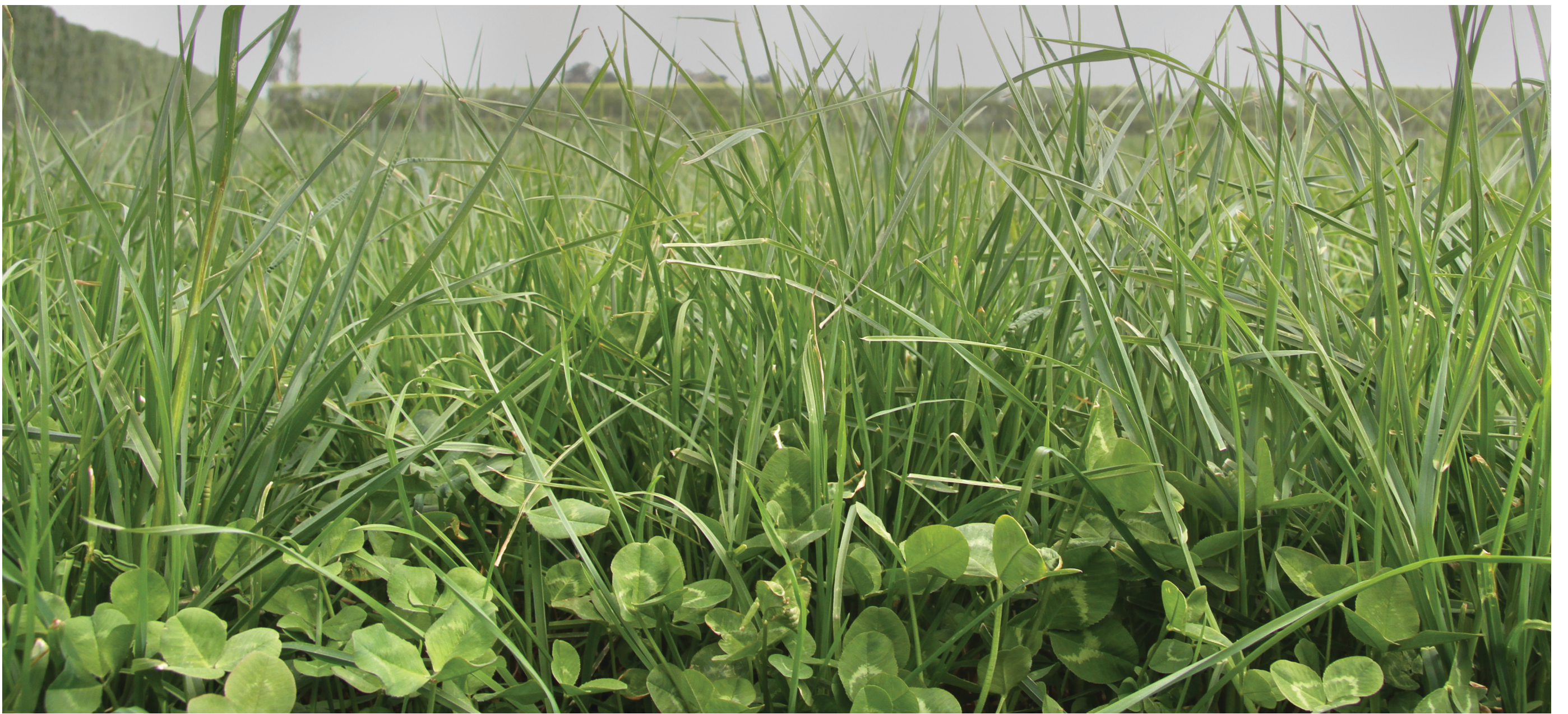
Redefine is about making friends with legumes, so it's nicer to eat.