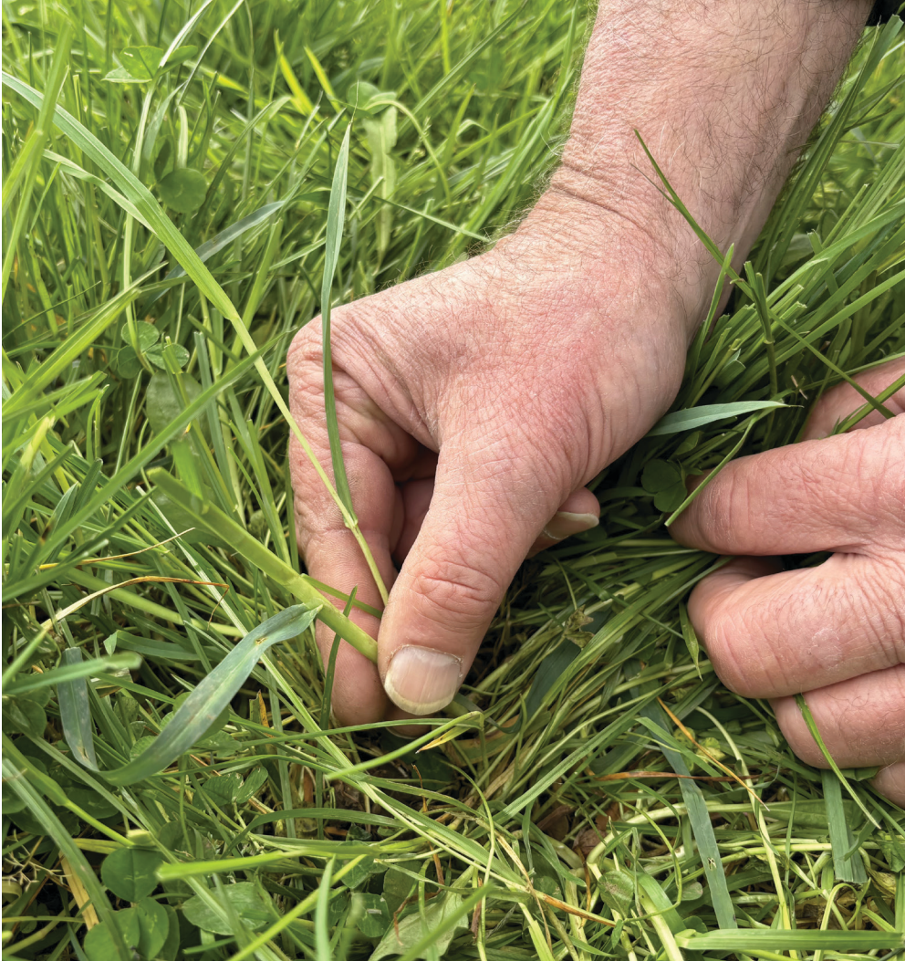
Redefine strengthens pasture.

Redefine cocksfoot is owned & marketed by Barenbrug, & protected under the NZ Plant Variety Rights Act